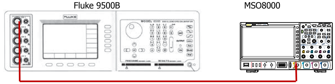
Figure 2-5 Timebase Accuracy Test Connection Diagram