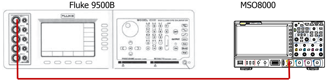
Figure 2-3 Bandwidth Test Connection Diagram