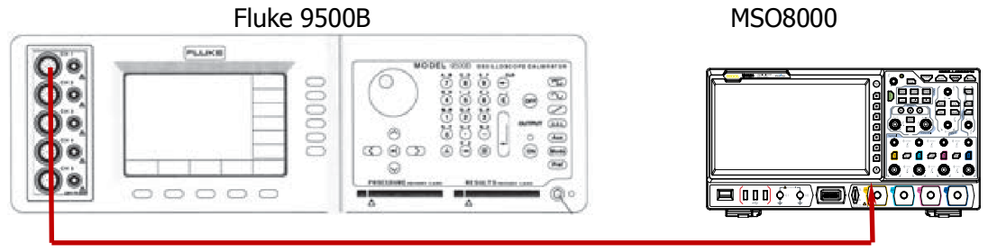
Figure 2-4 Bandwidth Limit Test Connection Diagram