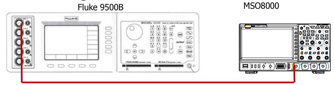
Figure 2-1 Impedance Test Connection Diagram